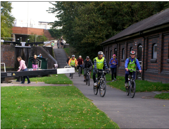
Get Cycling riders at Nine Locks, Brierley Hill

Please note that rides will NOT take place when there is ice, snow or severe weather